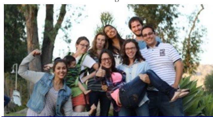
Future Entomologist: New graduate students at the fall picnic, September 2016

Second Place, Poster Competition, American Mosquito Control Association annual meeting